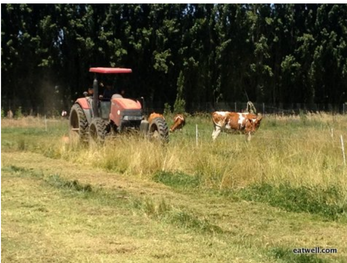
Roberto mowing the tall grasses that the cows have not eaten. We have already sown new pasture seed.

The farm is in a long term plan to change how we water our crops. We are switching to purely night time sprinklers to reduce evaporation and installing permanent sprinkler lines to save the work of moving them. All the trees will have mini sprinklers on timers too. At the front of the farm our pond, which was dug to cover the farm house with soil, will take in water from the canal 24/7 but we will pump out of it only at night. Last week we took delivery of the pipes which