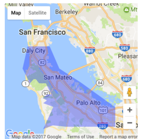
Peninsula Home Delivery: Daly City through Sunnyvale